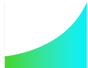
16% compound annual growth in spending on DX and related services*